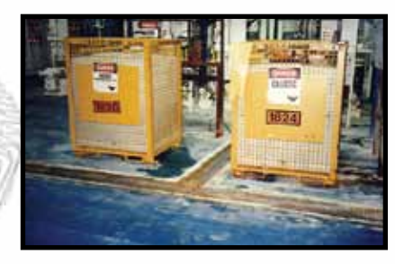
Super Vi-Corr® Resin for Highly Corrosive Environments