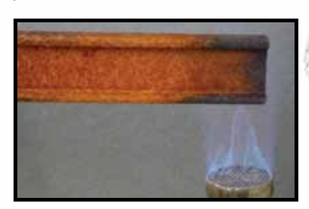
Phenolic Resin with Low Smoke and Flame Spread

Fibergrate offers the widest selection of resin formulations, each specifically developed to solve the many environmental and performance requirements of this changing world. From greener technologies to products that offer unique smoke, corrosion resistance or fire performance characteristics – only Fibergrate has the knowledge and experience to provide these unique products.