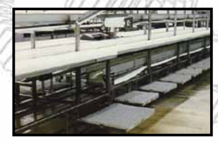
FGI-AM® Resin with Antimicrobial Properties