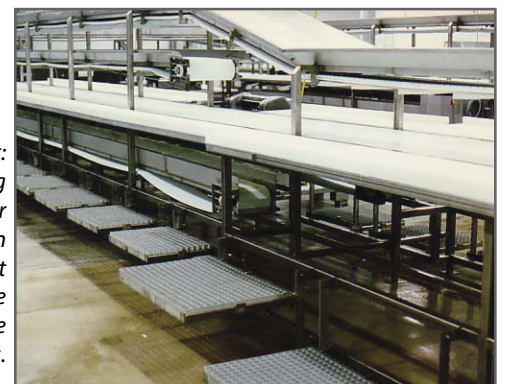
Photo on Right: FGI-AM ® grating was utilized for work station platforms that could adjust to the height of the line workers.