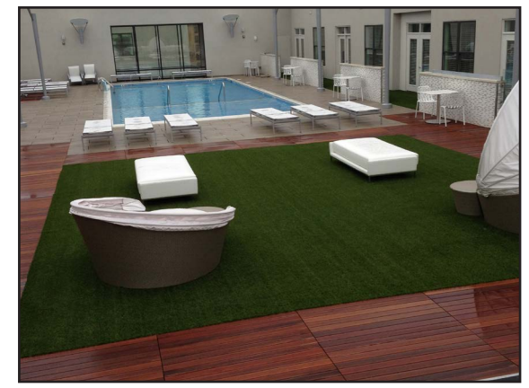
Fibergrate molded grating was used with Bison Pedestals to hold the grating, along with stone and wood pavers, used on the roof of this luxury apartment building. Artificial turf was placed over the grating resulting in low