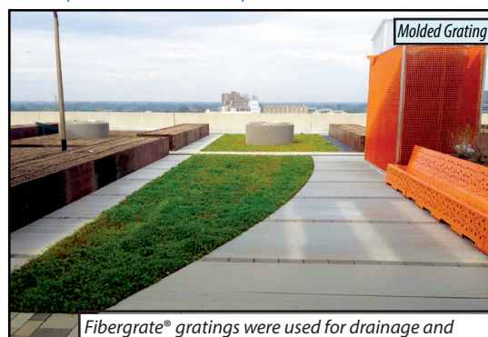
walkways in front of the planter boxes on this rooftop green space. Molded grating was also used to make a storage area more aesthetically pleasing.