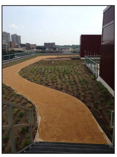
A city view from the landing of the rooftop platform.