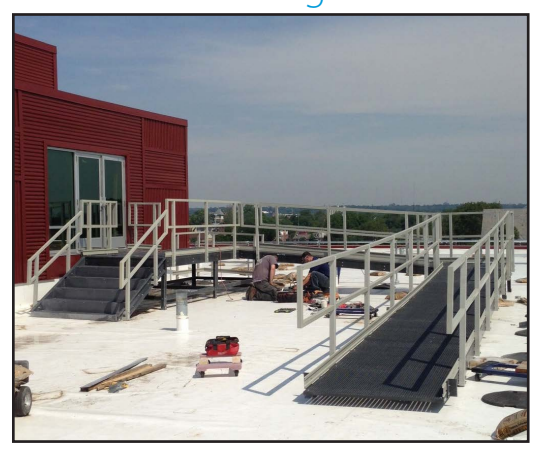
Some sections of the platform were fabricated on the ground before being lifted to the rooftop.